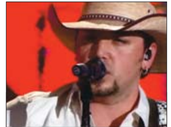
Jason's latest No. 1 was co-written by his good friend, David Lee Murphy. The video features Jason performing the song in concert.