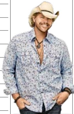
Toby's best in one big collection