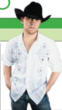
Justin's debut CD features the hit single "Small Town USA."