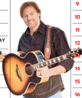
Darryl's Top 20 tune is based on a real-life story.